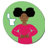
Vomiting / Diarrhea