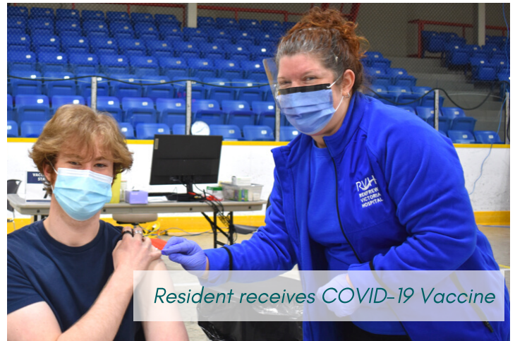
Resident receives COVID-19 Vaccine

All residents aged 12 and older are now eligible to book a first and second dose appointment for vaccination (must be 12 years of age as of the date of vaccination)