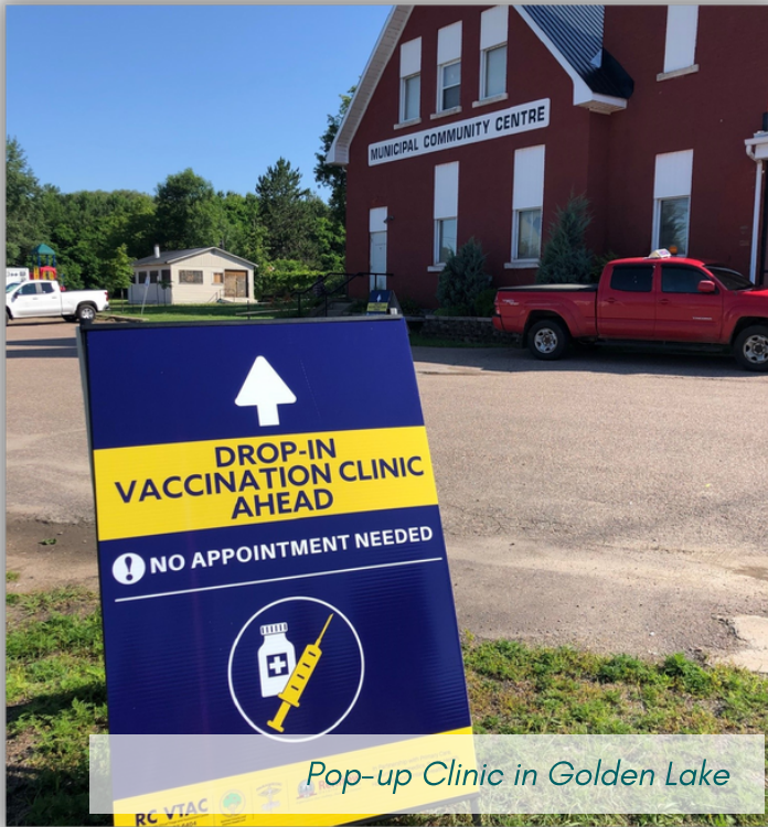
Pop-up Clinic in Golden Lake