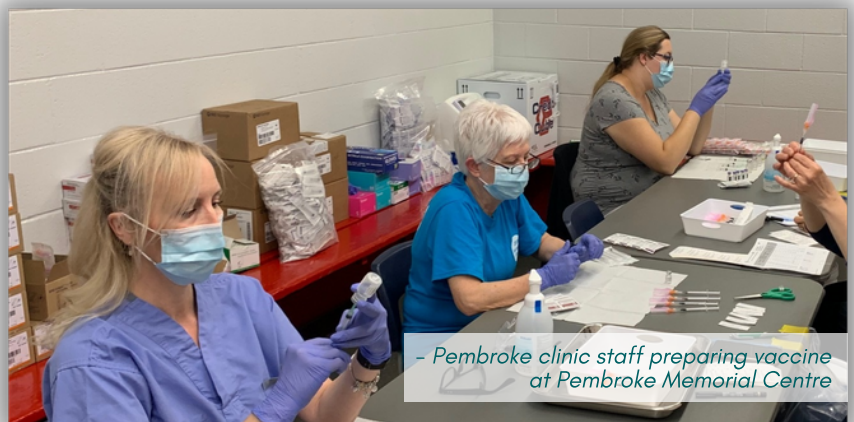
- Pembroke clinic staff preparing vaccine at Pembroke Memorial Centre

To add your name to the Weekly Extra Dose Sign-Up List, click https://bit.ly/3wFWMVY or visit www.rcdhu.com and click on the COVID-19 Vaccine Rollout webpage and scroll down to the link for the Weekly Extra Dose Sign-Up List. The Extra Dose Sign-Up List is not in place of booking an appointment and everyone should continue to book appointments as they become available. Full details at: New Weekly Extra Dose Sign-Up List Developed .