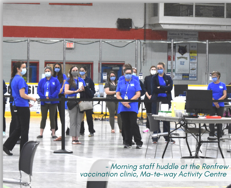
- Morning staff huddle at the Renfrew vaccination clinic, Ma-te-way Activity Centre