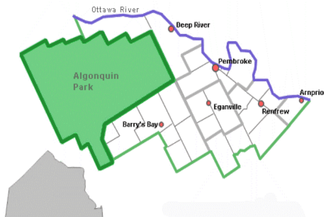
Figure 1: Map of Renfrew County and District

Renfrew County and District (RCD) is located in the Ottawa Valley in Eastern Ontario, Canada. It comprises the County of Renfrew, the City of Pembroke, the Township of South Algonquin and most of Algonquin Provincial Park. The total land area including Algonquin Provincial Park is 14,980 square kilometres. RCDHU serves 19 municipalities with a total of 109,087 residents (projected for 2021). 1 Almost half (48%) of the population lives in rural areas. 2