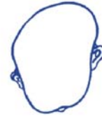
Flattening to one side of the back of the head