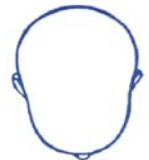
Normal head shape