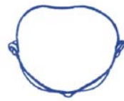
Flattening across the back of the head

A flat head is when there is a flat spot on one side of the back of the baby's head or across the back of the baby's head. This can happen in a few weeks to a few months. When the flattening is to one side, the baby may have changes to the position of one ear and to the shape of his face.